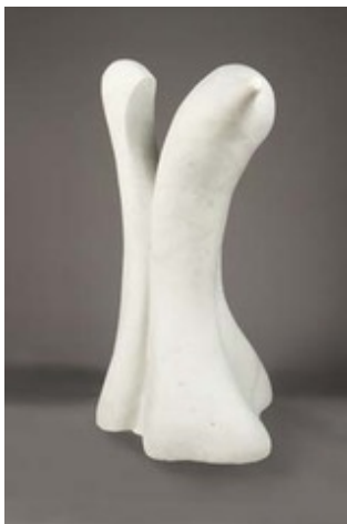
Charlie Kaplan, Charlie Kaplan , 2003, Carrara Marble, 38 x 20 inches

Opening: January 19th, 2013 6:00 PM - 8:00 PM