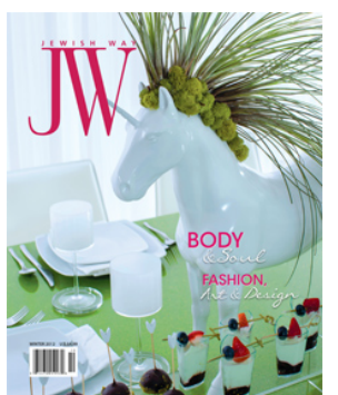
See all Editions